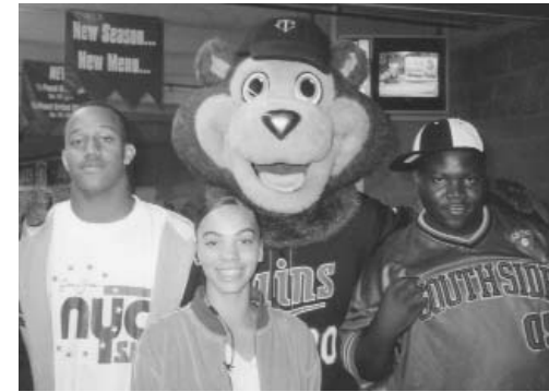
Pictured are a few of the A.C.E.S. students on a high school fieldtrip to a Twins baseball game.